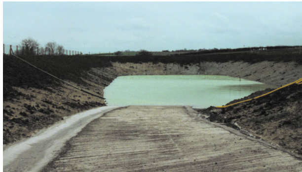
Earth-banked slurry store with access ramp

When calculating the capacity at least 750mm must be added to the depth for freeboard (See References 6&7).